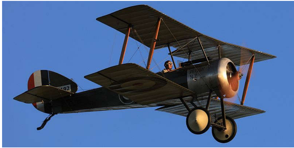
The Nieuports (below) are a very attractive aircraft and were thrown around with great aplomb. Historically they were a successful design, and important as being one the resolutions to the infamous "Fokker Scourge".