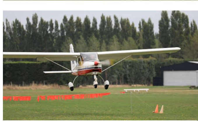
Above, Roy Waddingham skips over the fence in Tecnam PAB