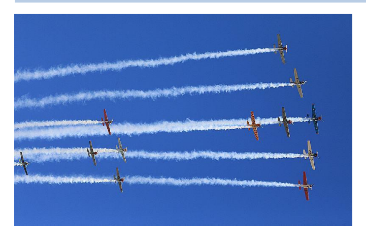
Page 19 lower half , I could watch this all day – Yak 3U 'Steadfast' creating poetry in the sky.