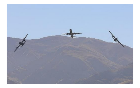
Page 12 lower photo and top left , the RNZAF's new P-8A Poseidon Maritime Patrol aircraft did a gentle fly by in deference to the fact that it's still working up to operational status.

Above centre and right , the RNZAF's Kiwi Thunder team was an excellent demonstration of displaying aircraft of different performance envelopes safely, the two C-130H Hercules (NZ7001 and NZ7002) and the 727 (NZ7571) kept a tight formation and did a huge break towards the crowd.